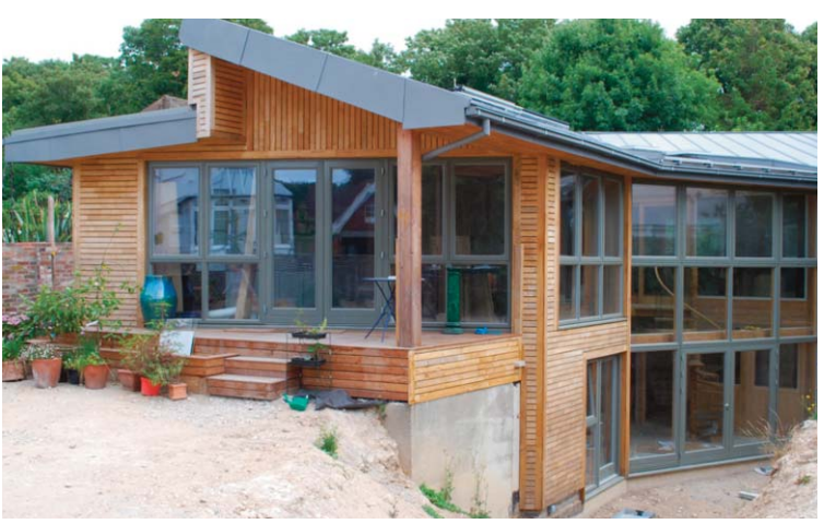
Photos clockwise from top left: Support Aylesbury Vale Environment (SAVE); Transition Stroud; Hornbeam Environment Centre; Low Carbon Trust; Carbon Co-op; Exeter Community Energy