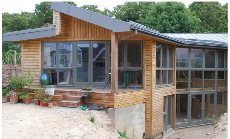
Photos clockwise from top left: Support Aylesbury Vale Environment (SAVE); Transition Stroud; Hornbeam Environment Centre; Low Carbon Trust; Carbon Co-op; Exeter Community Energy